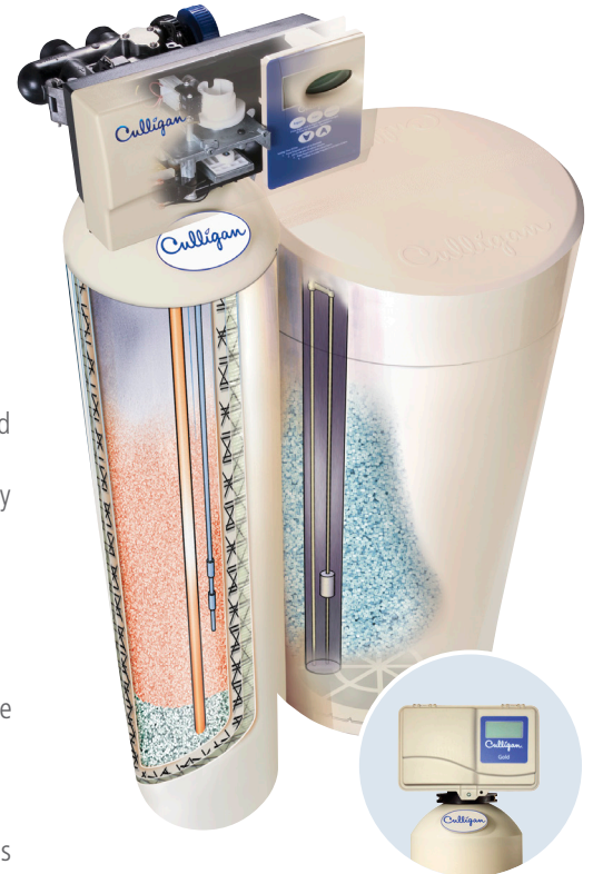
Culligan Gold Series™ outdoor model shown